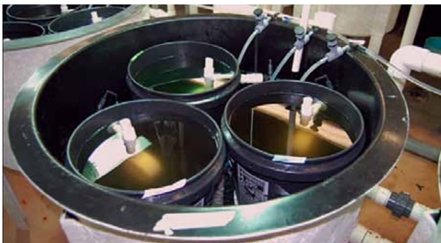
Yellow tang eggs were stocked in 20-L tanks with controlled lighting and a continuous supply of upwelling treated saltwater maintained at constant temperature by a surrounding water bath.

Part of the challenge in working with these tiny, fragile larvae was the need to develop small-scale, specialized larval-